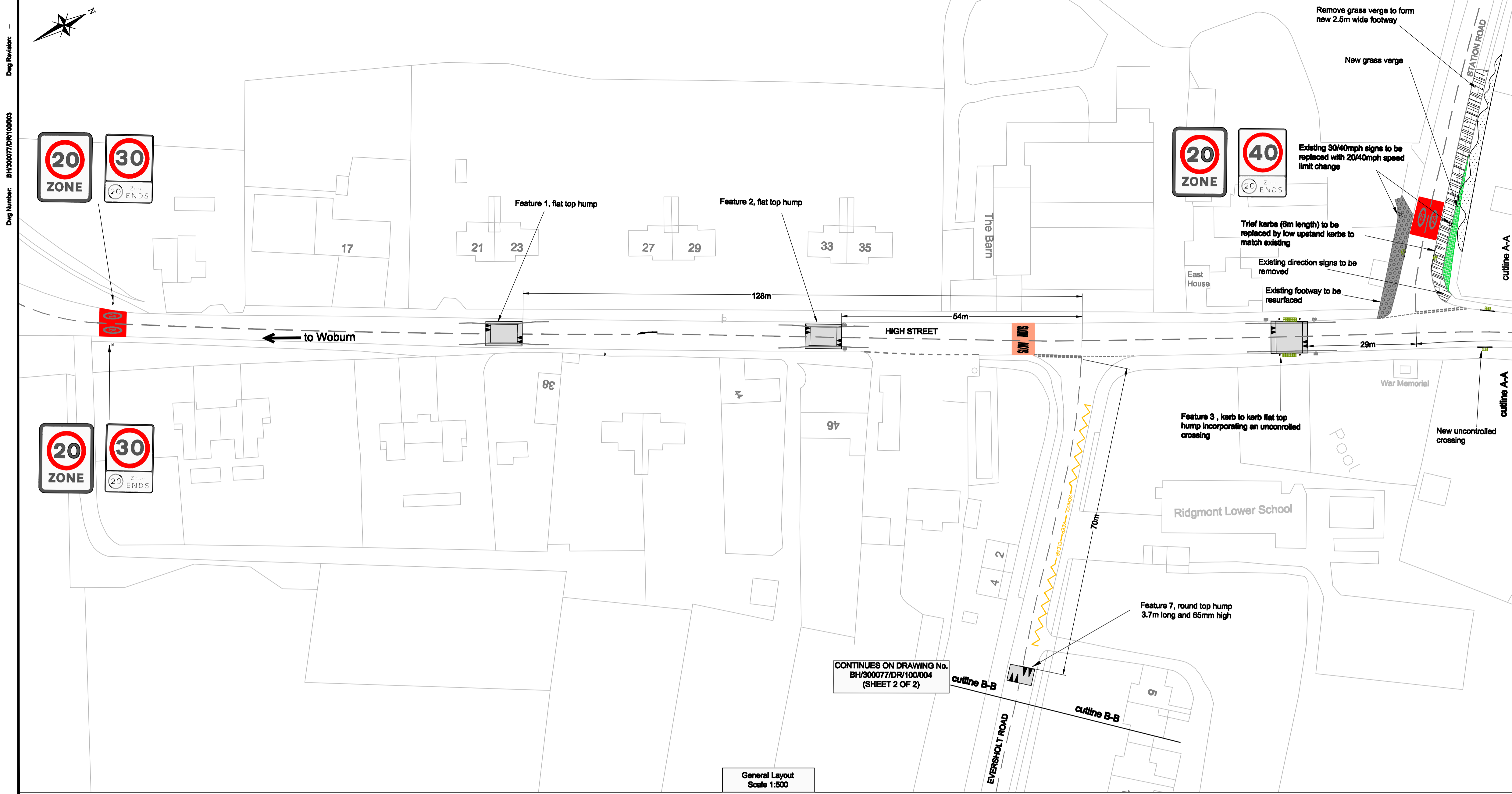
General Layout Scale 1:500

CONTINUES ON DRAWING No. BH/300077/DR/100/004 (SHEET 2 OF 2)